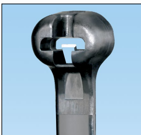
Dome-top head with smooth, round edges