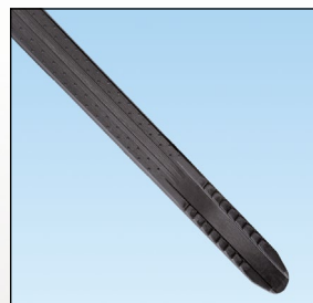
Anti-slip strap body and finger tip grip