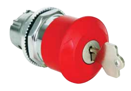
Trigger Action E-Stop Units, Non-Illuminated