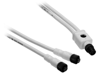
DC Micro V-Cable