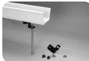
Center Support Bracket Kit (FGS-HTUB-XX)