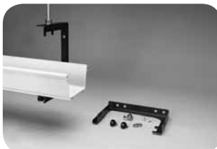
Top Support C-Bracket Kit (FGS-HNTS-XX)