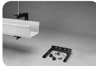
Top Support Low Profile C-bracket Kit (FGS-HNTS-XX-LP)