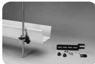
Modified Existing Threaded Rod Bracket Kit (FGS-HETR-5/8-A shown alone and attached to threaded rod)