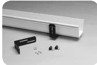
L Bay Support Bracket Kit (FGS-HLBK shown alone and attached to 4x4 FiberGuide)