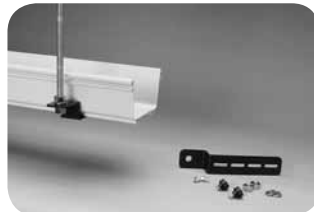
Modified New Threaded Rod Bracket Kit (FGS-HNTR-5/8-A shown alone and attached to threaded rod)