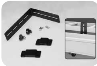
Ladder Rack Cantilever Support Bracket Kit (FGS-HDLB-4)