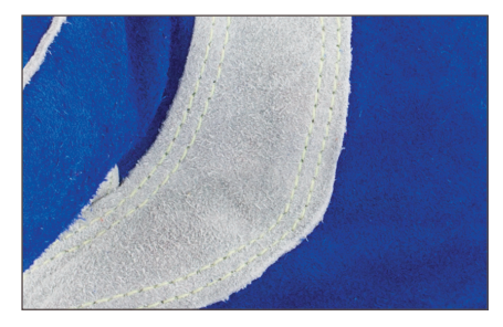
Wide reinforcements provide extra protection in high wear areas and help extend the life of the glove.