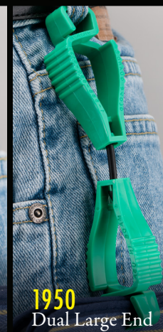
1950 Dual Large End