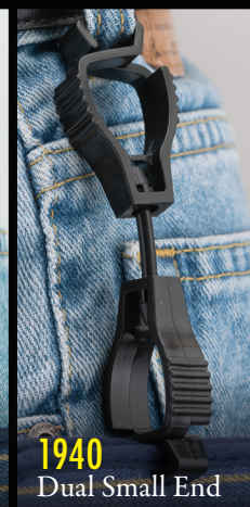
1940 Dual Small End