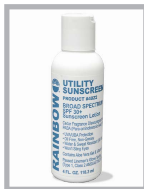
4-oz. Bottle #4022