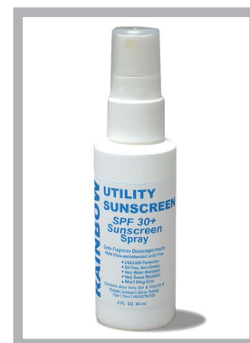
2-oz. Pump Bottle #40223