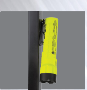
Hands-free magnet in base