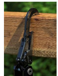
Fig. 4 - Not for Human Support