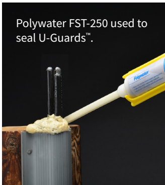
Polywater FST-250 used to seal U-Guards™.