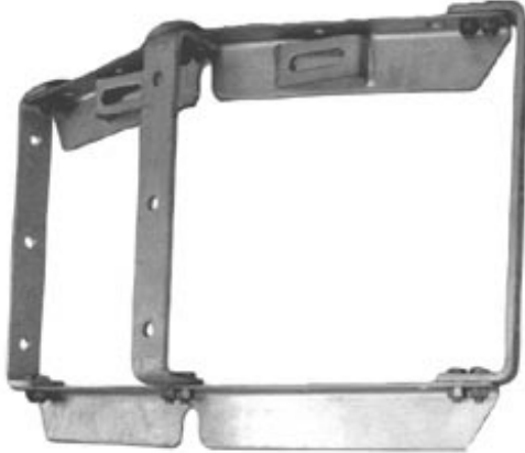
Bracket, Transformer, Wing-Rack Type