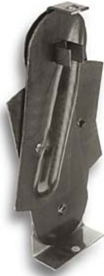
Expanding Pole Key Anchor