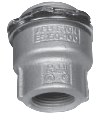
Standard Hub with Locknut and Sealing Gasket Option (Suffix – BLSG)