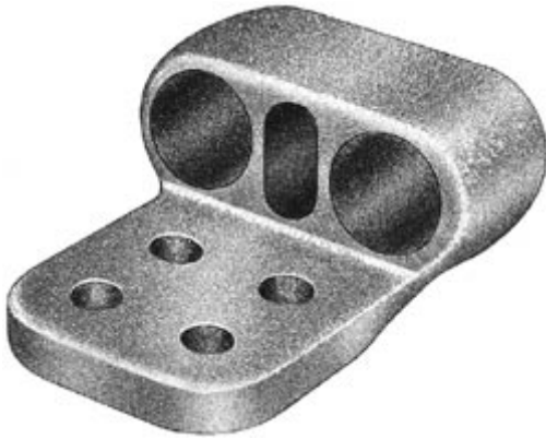
Terminal, Aluminum Weldment, Two Cables to Flat, cable range 1.263-1.315 Pad: 4 hole, 4 in