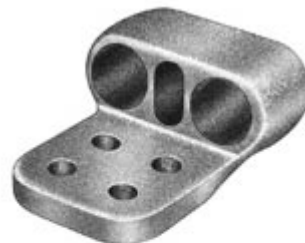
W2CF Series Two Cables to Flat Aluminum Weldment Terminals