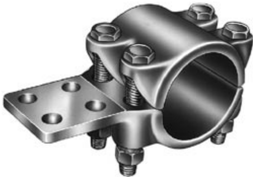
Tee, Aluminum Bolted, Tube to Flat, 3 IPS/EHIPS Main to 3 in, 4 hole flat Tap