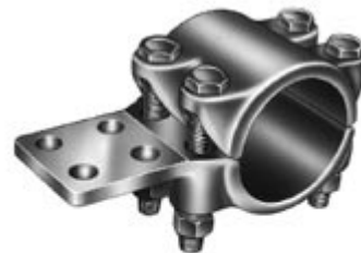
ATTF Series Tube to Flat Aluminum Bolted Tees