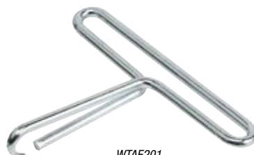
WTAE201 Tensioning Hook