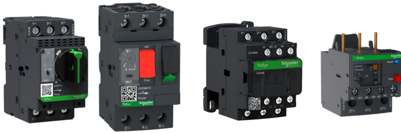
TeSys Power Deca Motor Circuit Breakers