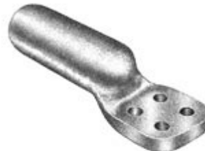
CCLS Series Cable to Flat, Short Barrel Aluminum Compression Terminals