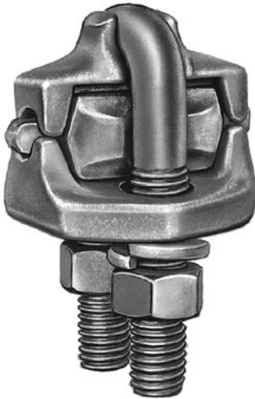
Single U-Bolt Aluminum Parallel Groove Connector