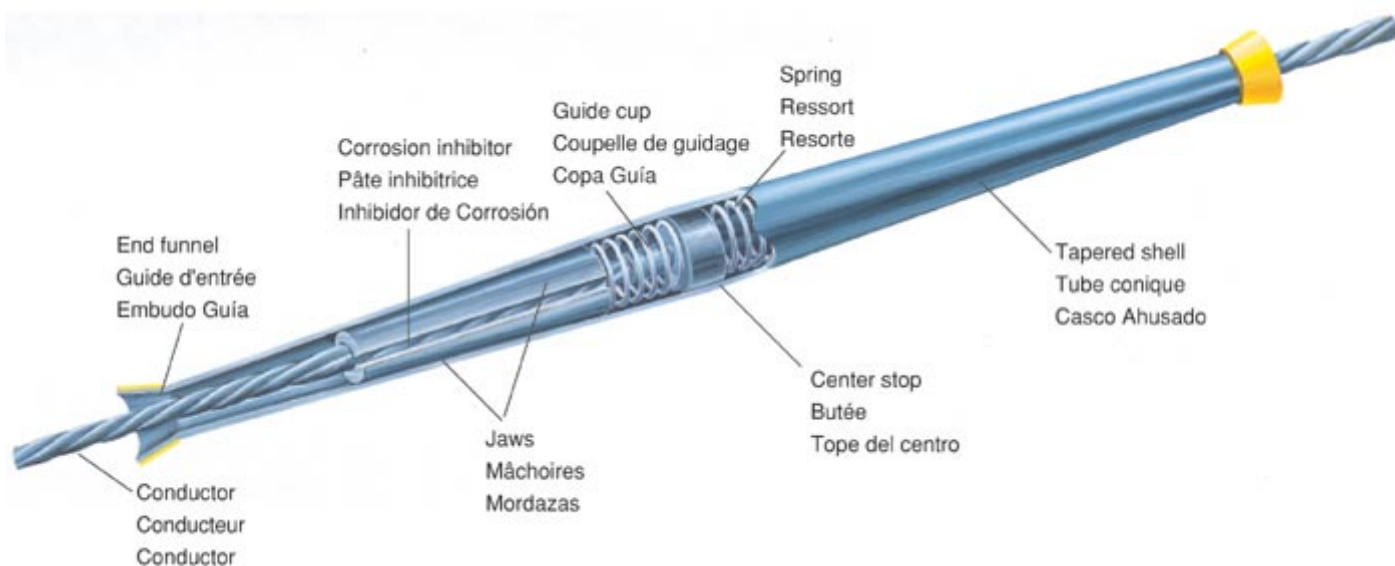
Inside an Automatic Splice.