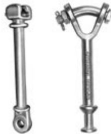
Hot-Line Links Extension/ Working Links