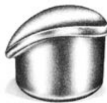
WTT-15 Series Tube to Tube, 15 Degree Aluminum Weldment Tees