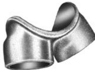
WTT2-15 Series Tube to Two Tubes, 15 Degree Aluminum Weldment Tees