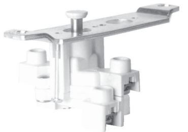
Heavy duty motor control push button switch