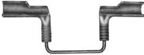
Aluminum Overhead Compression Stirrup