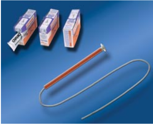
10.4 amp, Type SloFast Cutout fuselink with a 23" (584.2mm) pigtail.