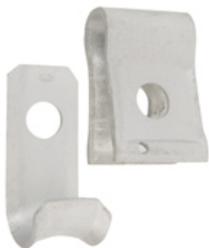
Figure 8 Cable Hanger, used to support integrated messenger wire. Accomodates .109" to .134" solid messenger wire. Clamp consist of two parts, "J" hook and the clamp. Installed with a 1/2" machine bolt and two square nuts (ordered seperately). One nut is placed between the hook and clamp for spacing and the other is used to tighten the clamp member.