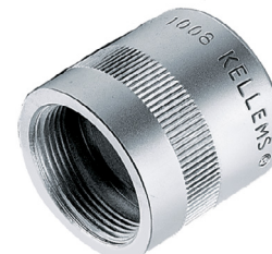
091041006 Thread Adapter