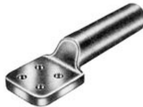
BCL Series Cable to Flat Copper Compression Terminals