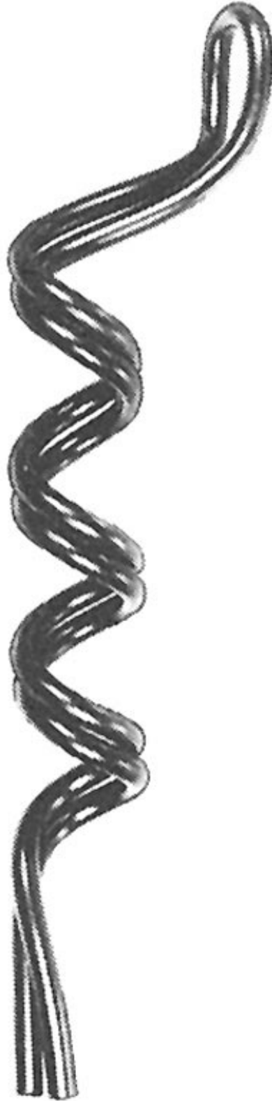
Side Opening PVC Riser Tie