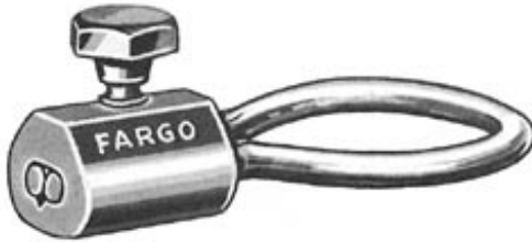
Equipment Lock, Offset Ring, Torque Head Bolt