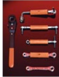
GP Series Hand "Speed" Wrenches for installing bolted and mechanical connectors