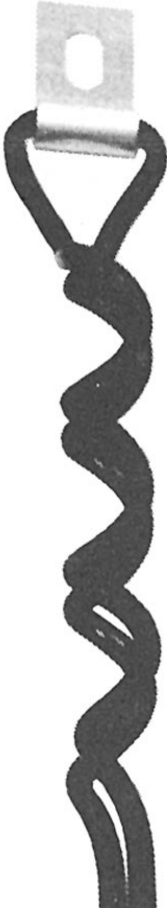
Side Opening PVC Riser Tie with Aluminum Mounting Bracket