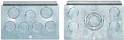
Two of each end plate shown are supplied with the load center