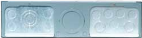
Load center end wall with both plates installed