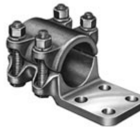
ASTF Series Tube to Flat Aluminum Bolted Terminals