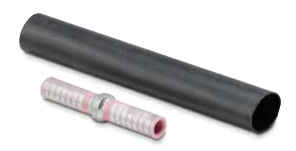
RRK 40 HS