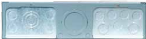
Load center end wall with both plates installed