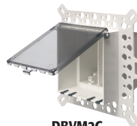
DBVM2C Two-gang for Stucco

IN BOX meets 2014 NEC, Section 406.9 (B) for the protection of exterior outlets which require the use of an extra-duty weatherproof while-in-use cover for all outdoor 15 or 20 AMP receptacles. Also meets 2015 CEC (Rule 26-702) for receptacles exposed to the weather.