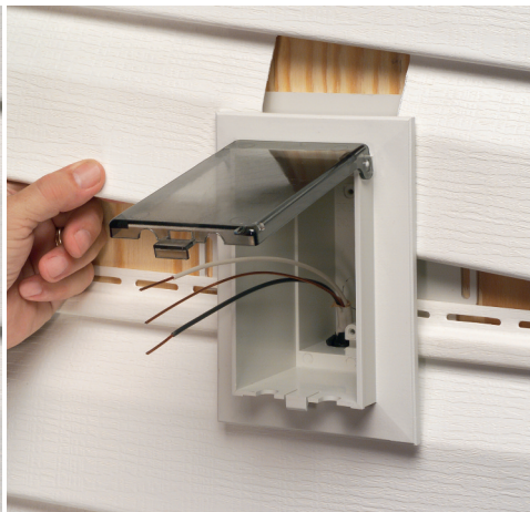
for New & Existing Vinyl Siding