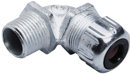
ABB cable glands – MSG-90 series General purpose cable glands

Ideal for installations such as robot manufacturers, packaging equipment, machine tool building and other industrial OEM and MRO applications.