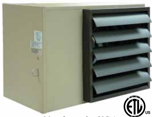
Manufactured in U.S.A.

3.3 KW THROUGH 48 KW HORIZONTAL DISCHARGE SUSPENDED FAN FORCED UNIT HEATERS AVAILABLE IN 1 OR 3 PHASE FOR ALL STANDARD VOLTAGES FROM 208V TO 480V.