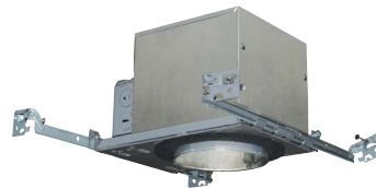
12¼" L x 6¾" W x 6" H Ceiling cutout: 4½" diameter