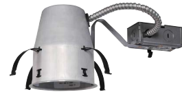
12" L x 4¼" W x 5½" H Ceiling cutout: 4¾" diameter