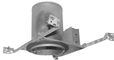
11¼" L x 6¾" W x 7½" H Ceiling cutout: 5½" diameter