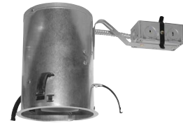
12½" L x 5¾" W x 7½" H Ceiling cutout: 5½" Diameter