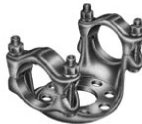
AUR Series Tube to Insulator Aluminum Bolted Bus Supports