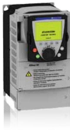
Altivar 61 Drive