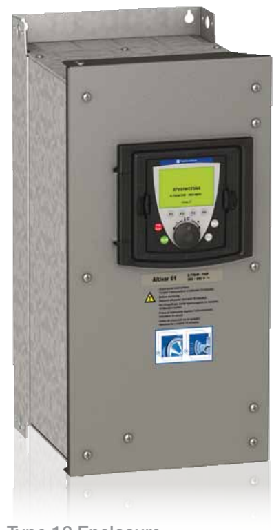
Type 12 Enclosure