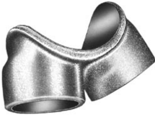
Tee, Aluminum Weldment, Angle, Tube to Two Tubes, 2 to 2 IPS/EHIPS tubes