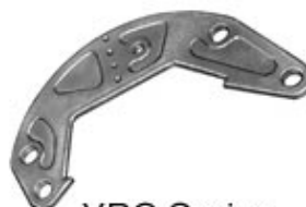
YPC Series Yoke Plate, Crescent Angle Suspension Yokes