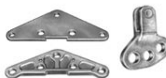
Yoke Plates & Yoke Assemblies

Yoke Plate, 15-75 deg. Angle Single String, Steel, UTS 50,000 lb