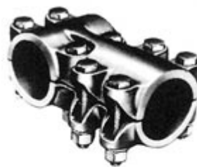
TTH Series Tube to Tube Bronze Bolted Tees