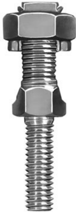
Grounding Clamp, Copper Split-Bolt, Threaded Stud, Two Cables