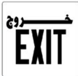
SW65 (Makhraj Arabic)

Dual-Lite's cast-aluminum SE Series exit signs feature an option for custom or standard special-wording. The images below represent a sample of standard special-worded signs available. A comprehensive list of all standard special-wording signs is shown on the next page. Because the artwork and silk-screening for these signs were previously developed, pricing for these standard special-worded signs do not incur a setup charge. If your special-worded requirements do not show up on this list, please contact the factory to request your custom special-worded sign. Custom special-worded signs will incur a one time setup charge for each development.