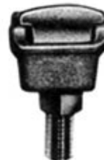
TLS Series Tap Lug, Single Cable Bronze Bolted Terminals