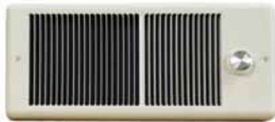
WITH IN-BUILT THERMOSTAT