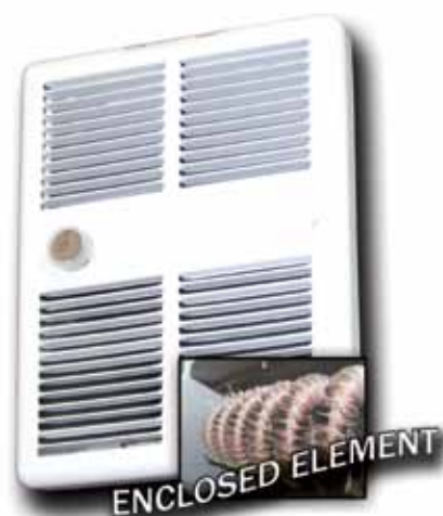
SHOWN WITH BUILT-IN THERMOSTAT